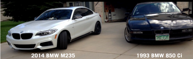
2014 BMW M235